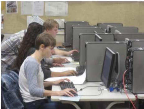
Computer Drafting Competition

On Friday February 3, 2017 , San Joaquin Delta College will host its Engineering and Technology Day. SJEC is proud to sponsor this event providing graders, proctors, awards, and refreshments.