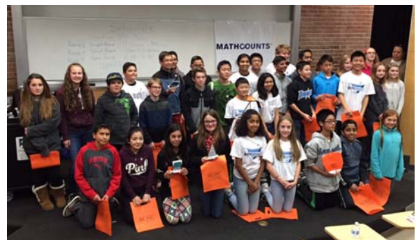
2016 MathCounts Participants