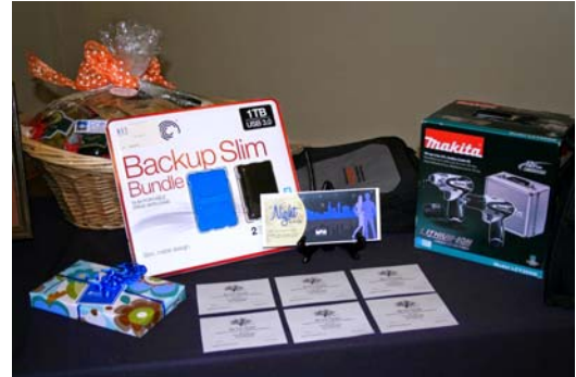
Raffle and Auction Items

Among the items in the 2016 auction and raffle were a Bird House, four Water Color Paintings, a Wine Gift Basket, several fine Wines, an Amazon Kindle Fire HD, a Pacific Gift Basket, a tool box, a Night On The Town In Davis, a Wine & Pasta Gift Basket, a Starbucks Gift Card and a Bluetooth speaker.