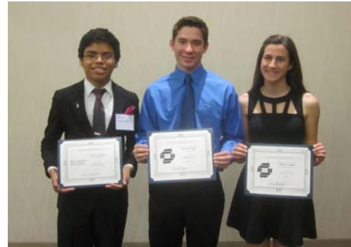
2016 Scholarship Recipients

The following societies, firms and individuals made generous contributions in 2016 to SJEC's General Scholarship Fund":